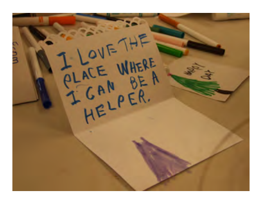
Children in Religious Education classes created care packages that the kids can carry in the car and give to homeless neighbors when they see them. This simple little gift bag is a neighborly thing to do and makes a difference in understanding 'right relationship'.