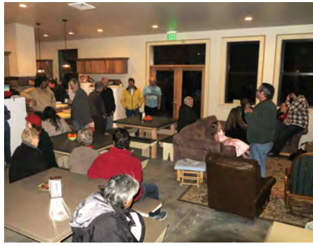
Residents in community room