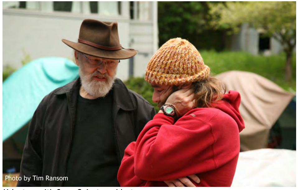
Volunteer with Camp Quixote resident