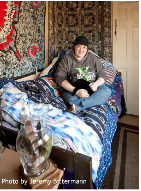
Resident settled at Quixote Village