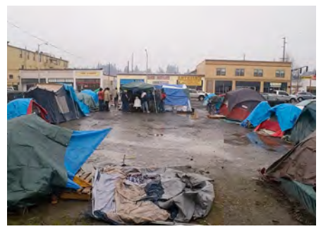
Camp downtown in 2007

After heated debate the Board reached consensus to offer sanctuary, and the next day the campers began their move to our property. Within days special congregational and neighborhood meetings followed; overruling the