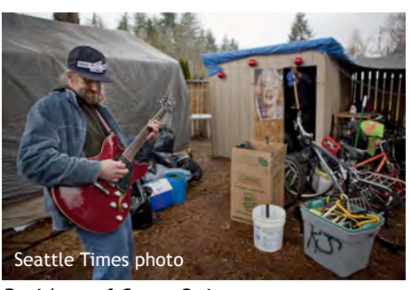
Resident of Camp Quixote