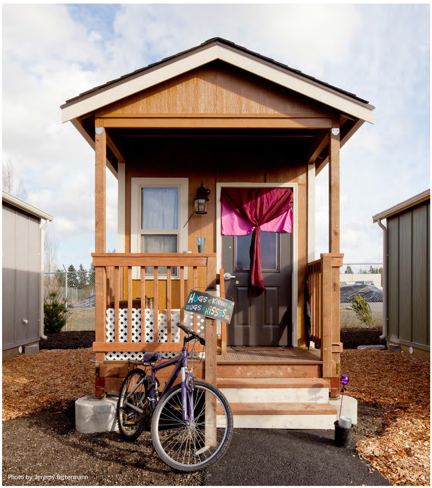
One of 30 cottages at Quixote Village in Olympia, Washington