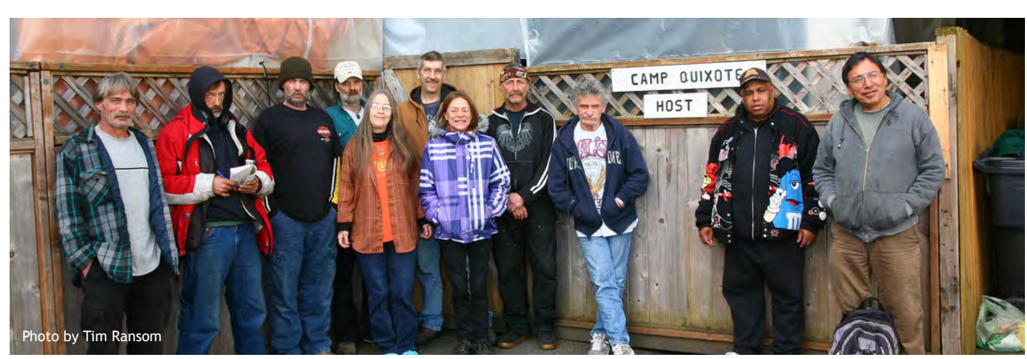
Eleven of the thirty residents of Camp Quixote in 2012

Quite a few people with mental illnesses sincerely believe that alcohol or street drugs do more to alleviate their most distressing symptoms than anything a doctor prescribes. Heroin makes the unloved feel loved; some people report that it's "like a warm hug." Others say that meth helps them concentrate and get things done, which makes them feel competent