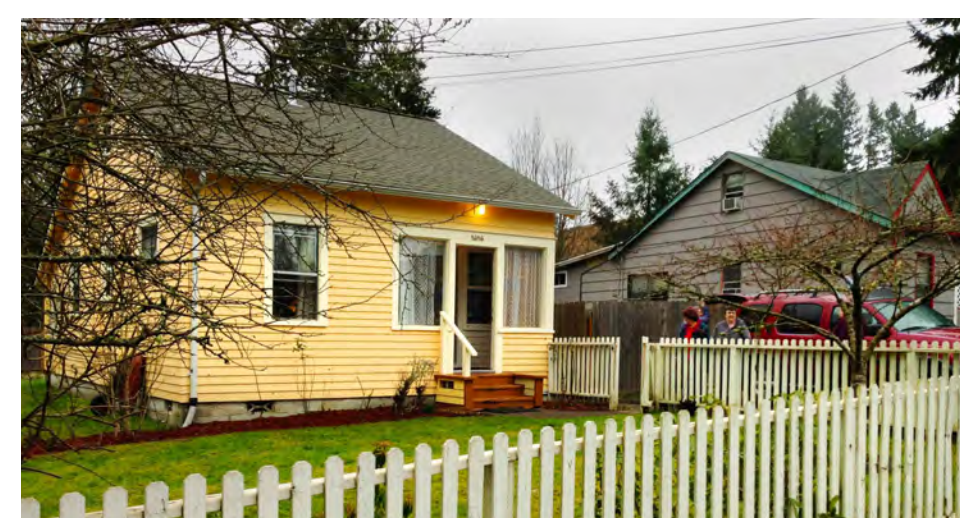
Valentine House in the Eastside Neighborhood of Olympia

Recently a fourth woman signed her lease, got her key, and joined the