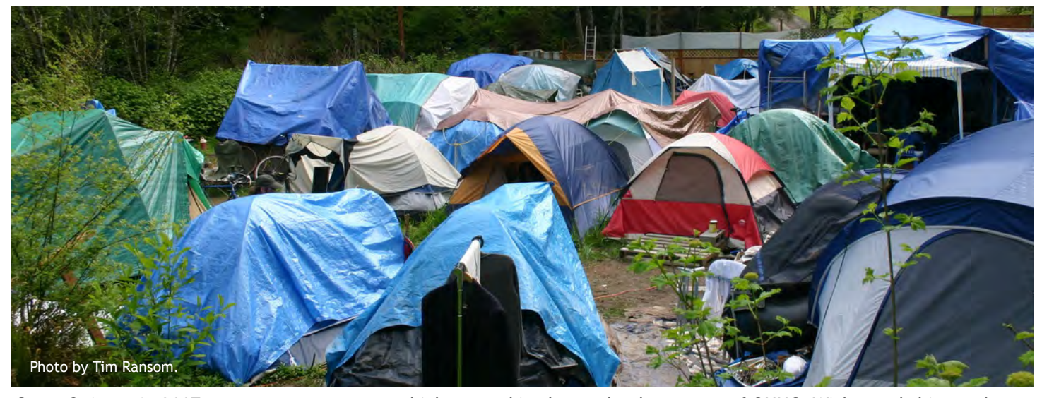
Camp Quixote in 2007: temporary sanctuary which started in the wetland property of OUUC. With wood chips and support from many, the camp evolved over time into a defined community.

The meetings of the Board and the Congregation [to vote on hosting Camp Quixote in February of 2007] were two of the most incredible and wonderful events in my life as a member of OUUC.