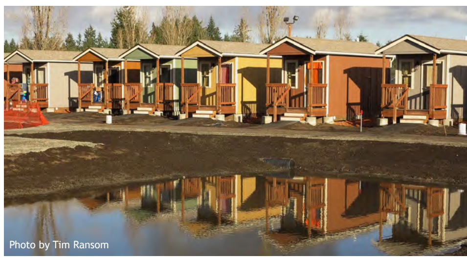
Quixote Village, a housing development for individuals who are homeless