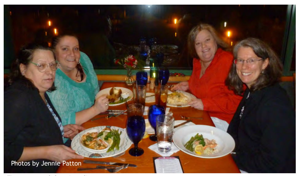
First year celebration dinner

My tenants have enriched my life in many ways this past year. I am truly grateful for the opportunity to be their landlord. Through the process we have had lots of laughs and many meaningful conversations. Friendships have deepened. I hope I have been able to help build their self-esteem and empower the