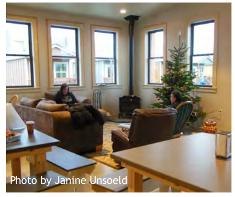
Dining and lounging space